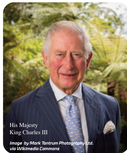
His Majesty King Charles III

Following the news that the Queen had passed away, the outpouring of grief could be seen around the world. In Britain, people queued for hours to walk past the Queen's coffin. On the day of Her