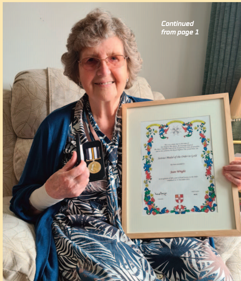
Continued from page 1

We are currently trying to obtain some stills from the DVDs and, if successful, we will show them in future issues.