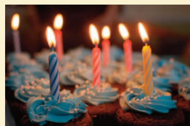
2 SPECIAL BIRTHDAYS From 100 to 107!