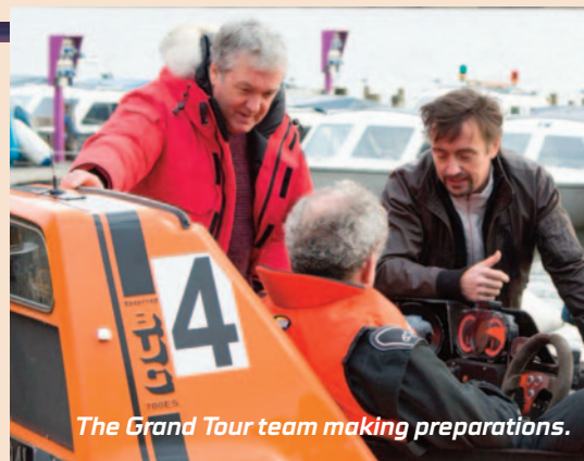
The Grand Tour team making preparations.