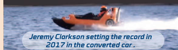
Jeremy Clarkson setting the record in 2017 in the converted car.

For those of our readers who like facts and figures.