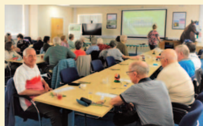
7 MEET-UPS AFTER LOCKDOWNS Cheers to happier days!