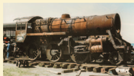
4/5 BUG, BEAR & BABY BETSY Plus 76077 back on track